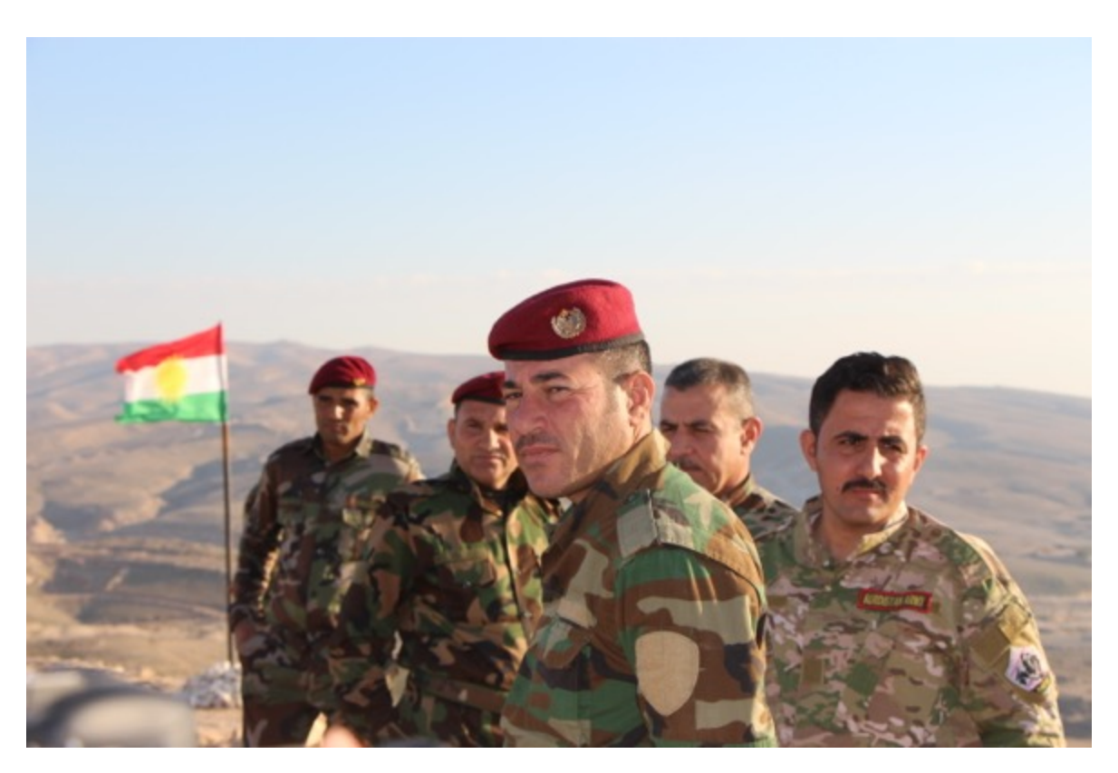
Kurdish Peshmerga from the 14th brigade on Qarachouk mountain.

In both these instances, MECRA's methods of field reporting, regional knowledge and close analysis were able to bring us to privileged information, which we were then able to reveal to the world. It is probably unnecessary to note that access to Syria is difficult and involves some element of considered risk. Very few journalists and researchers now enter. Yet Syria remains a geo-political space of paramount importance on the world stage today. We are thus pleased to continue our work in this area.