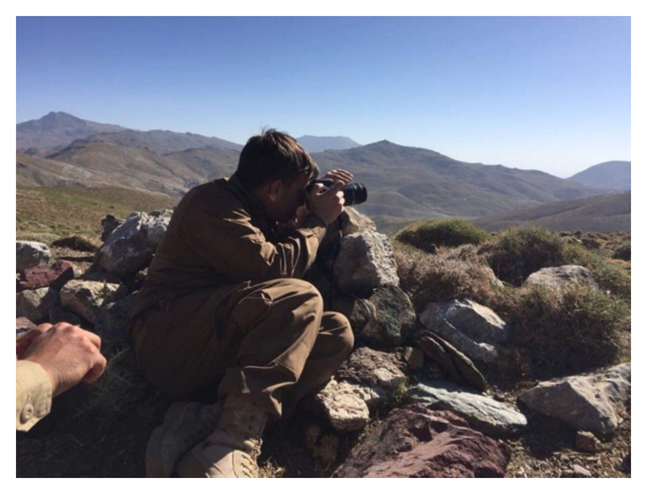
Zach Huff photographs IRGC positions from a location in the Iraq-Iran border area in the summer of 2018