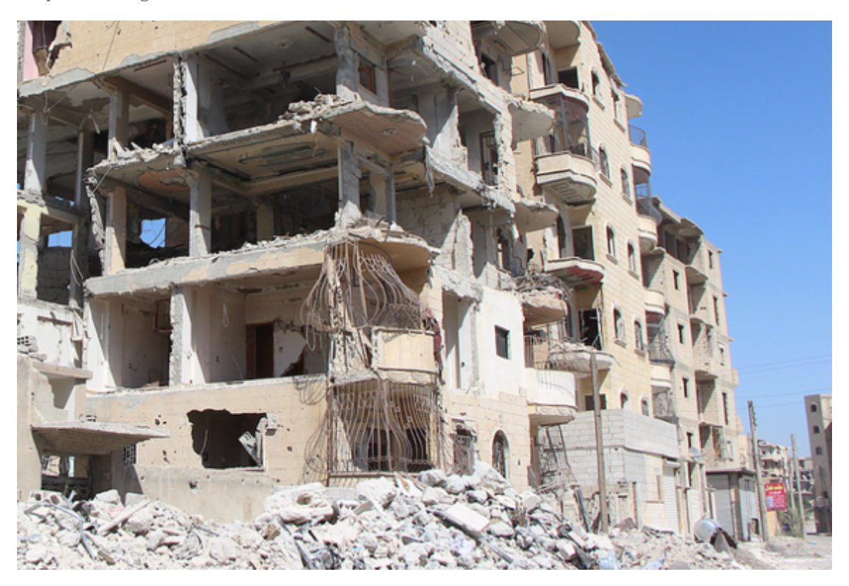
A destroyed building in Raqqa, Syria (Jonathan Spyer)

Our Twitter page (@MidEast_Center) has 1,600 followers. In November and December of 2018 MECRA reached 1.8 million people on social media with 396,000 engagements and 42,000 link clicks. We had 272,000 social media page visits in the same period with posts reaching 70,000 people a week on average. Our videos, in the last quarter of 2018, we watched for 2,149 hours, reaching up to 200,000 people a day. We found that the comments and visitors to MECRA's Facebook page were frequently in regional languages, often in Arabic, meaning we are reaching a Middle Eastern audience that is particularly interested in learning about what is happening in region. This gives us a unique window into the region and also ability to reach these viewers. MECRA also found success on Twitter and on its own homepage, where it continues to build up a following.