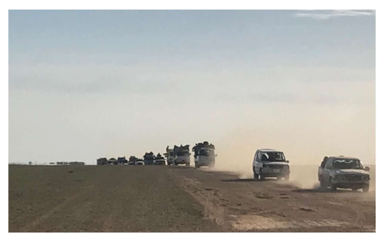
Syrians flee one of the last ISIS-held pockets near Baghuz in Syria in January 2019

several reports we published on our website, at The Jerusalem Post and on social media. Our video from Iran received 164,000 views and reached 369,536 people on Facebook, garnering comments and shares. It was the combination of regional knowledge (understanding how to discern important emerging stories, and therefore to focus on the PDKI prior to its becoming a major focus of media attention) and the presence of staff members on the ground in relevant places with specific knowledge and language skills, which enabled MECRA to reach the relevant information, and to understand and analyse its significance. The project of mapping opposition to the regime is continuing to bear fruit after August 31 with new reports on the attack on the IRGC in Ahwaz.