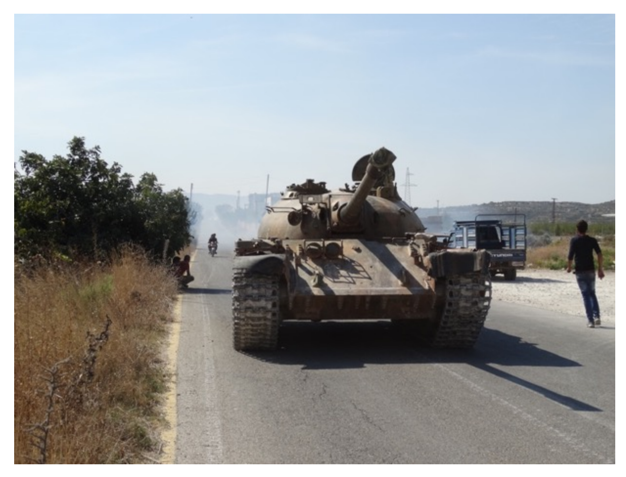
Heavy weapons are withdrawn from Idlib after the September Turkey-Russia agreement